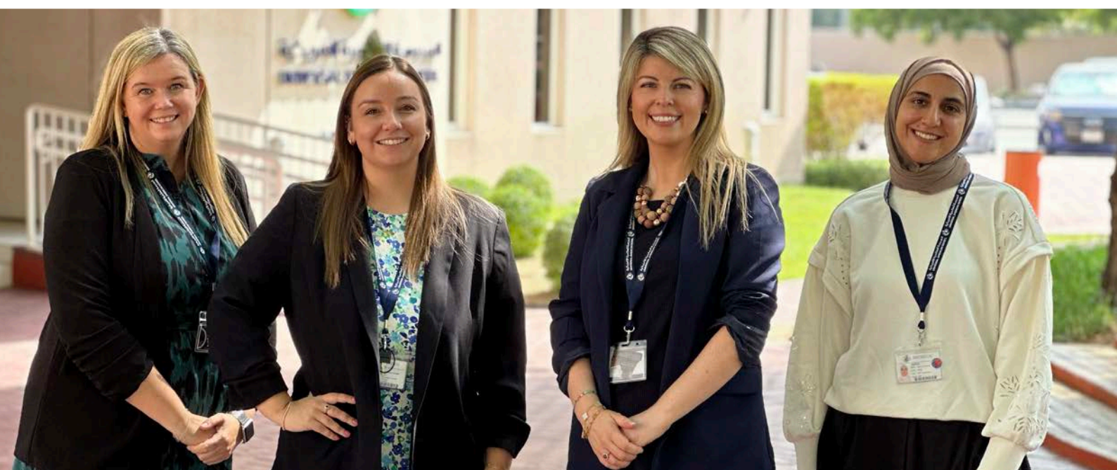
The UAS Elementary School Leadership Team

As a PYP school, student learning at Universal American School is organized through the PYP units of inquiry using comprehensive, research-based curriculum aligned to the philosophy of the PYP. Our program features exploration and discovery as a way of learning, enabling children to develop confidence, creativity, and lifelong critical-thinking skills.